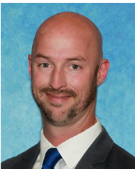
Mark Eldridge COUNCIL MEMBER PLACE 4 MAYOR PRO TEM